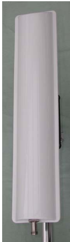
Sector Antenna 15 dBi 100°

This antenna is ideally suited for Access Points in outdoor environments, which need a strong and reliable connection to the clients. The wide horizontal beam width of 100° provides great freedom for the position of the clients as it is typically required for public ISP applications. Tappets on the back simplify mounting at the wall. Alternatively it can be mounted on a mast. This antenna combines maximal outdoor performance with mobility of the clients.