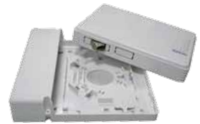
Optional Cable Tray

* This is an overview of CTS HES series and does not represent specific product details.