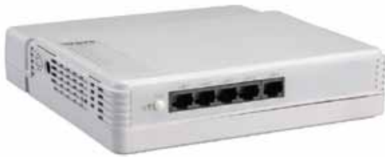
Without cable tray