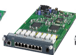
G.SHDSL Line Card SAM1008