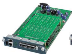
ADSL2+ Line Card AAM1212-51/53