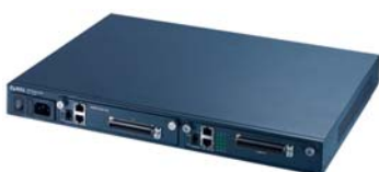
1U IP DSLAM with AC/DC Power IES-1000