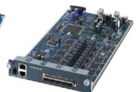
VoIP Line Card VOP1224-61